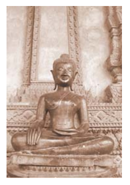
Laos, Chiang Chan Buddha Statue

"A righteous ruler would distribute wealth among the poor and help