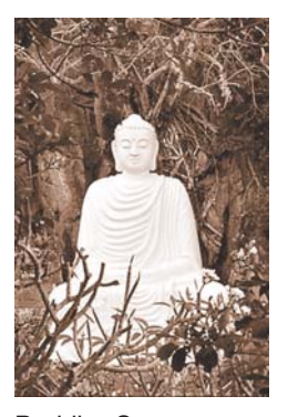
Buddha Statue, Vietnam

"Oh, Kalama, do not go by legends, by traditions, by scriptures, by logical conjectures, by references, by analogies, by agreement through pondering rituals, by probability or by thought. It is only after judging merits or demerits of anything that one