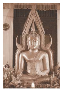
Buddha Statue from Temple of the Tooth, Sri Lanka

The second practices nonviolence, compassion and loving kindness in respect of society.