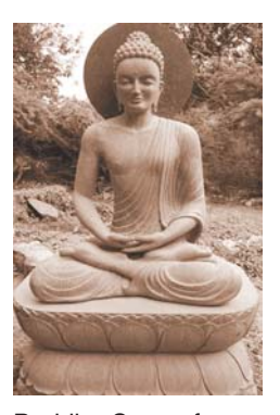
Buddha Statue from India

"According to our historical records the Sinhalese and Tamil people cannot claim themselves to be pure "Sinhala" or pure "Tamil". The terms "Sinhala" and "Tamil" are used only to denote separate identities. The Sinhala people living in the northcentral, east and central hill country are an admixture of Veddhas and Tamils. On the other hand, Tamils are a nation made up of South Indian Cholas, Pandyans and Pallawas. They all inter-mingled with the Sinhala people in the past and with Muslims and Burahers at present. According to history, the majority of the Sri Lankan Tamils are not Chola Dravidivans but have descended from Pandyans and Keralans. The majority of the people of Kerala origin claim Sinhala identity. Some people with a very clear South Indian origin but belonging to Sinhala castes appear for the defence of the Buddhists.